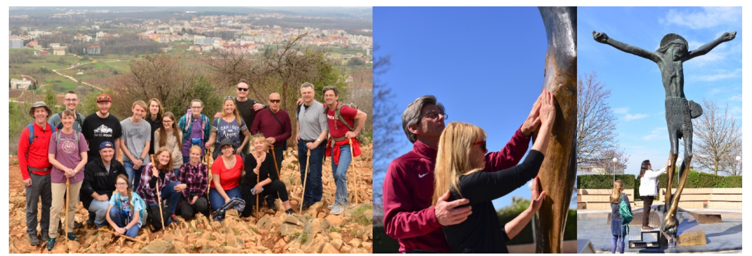
Climb Apparition Hill