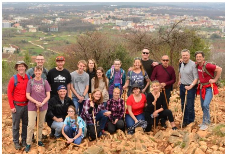
Climb Apparition Hill