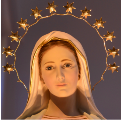
Our Lady of Tihljina

Son more deeply. Join us on a pilgrimage to this miraculous place.