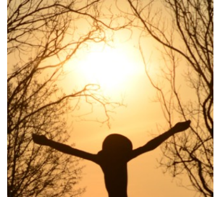
Statue of the Risen Christ

Medjugorje /med-ju-gor-ē-ə/ will shower you with innumerable gifts of the Holy Spirit. You will enjoy praying daily Mass more than ever. Adoration, Veneration of the Cross, and the Rosary may bring you to tears. The peace is so strong, you can feel the closeness of God. Our Lady is calling each of us to Medjugorje to know her