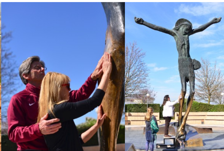
Visit the miraculous Statue of the Risen Christ

"If you knew how much I love you, you'd cry for joy!"